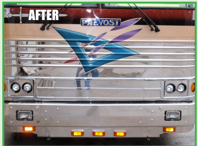
1997 Country Coach

Check out our Website! www.excaliburservice.com