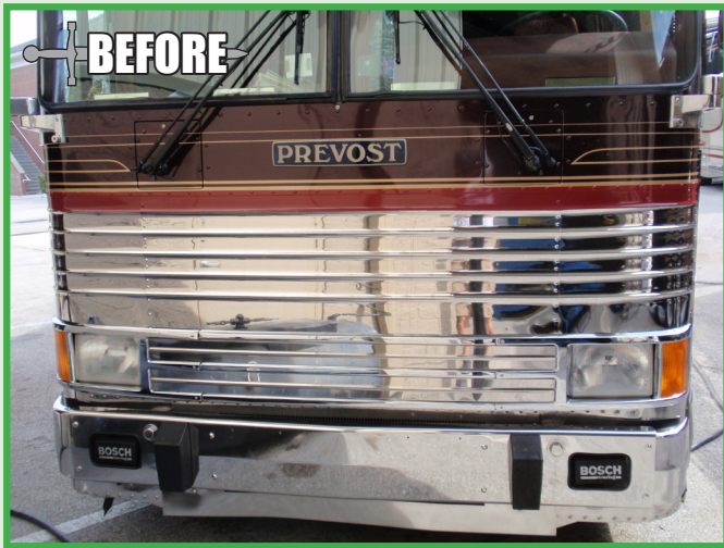
1990 Marathon XL

1830 Bobby Lee Point • Sanford, FL 32771 • Office: 407-302-9139 • Cell: 407-427-5489 • Fax: 407-302-9140