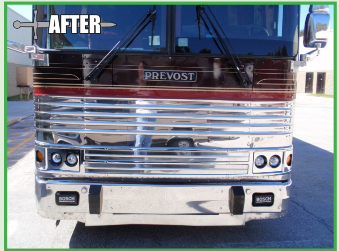
1990 Marathon XL